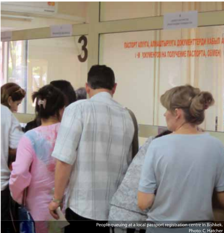
People queuing at a local passport registration centre in Bishkek.

Discrepancies between different pieces of legislation relating to the registration system invite corruption and undermine the effectiveness of the law. The IM 2002 clearly sets obligations on behalf of the migrant and the state, but other laws, regulations and decrees conflict with this. For example, whereas the IM 2002 requires an internal migrant to submit three documents in order to register their new address, other pieces of legislation require more. In reality, local administrative offices request up to 12 types of document, making the registration process onerous for internal migrants.