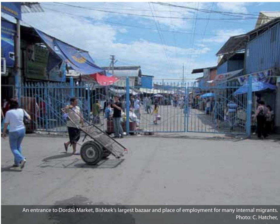
An entrance to Dordoi Market, Bishkek's largest bazaar and place of employment for many internal migrants.