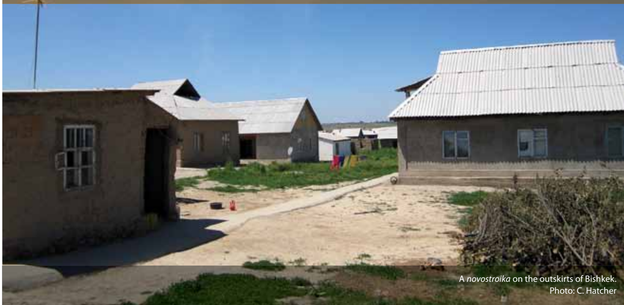
A novostroika on the outskirts of Bishkek.