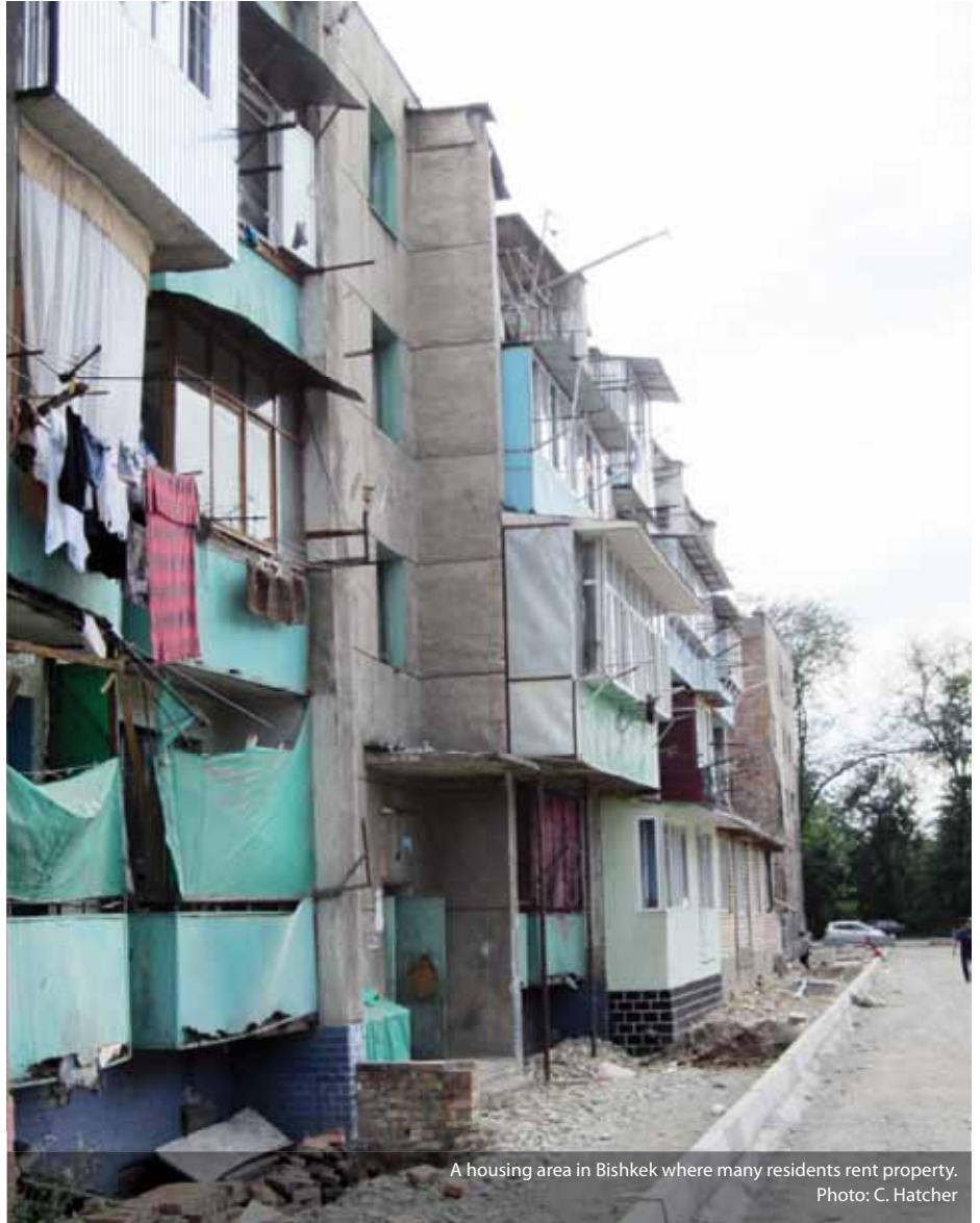
A housing area in Bishkek where many residents rent property.

The State Registration Service (the state organisation responsible for the passport registration system) should pursue existing recommendations to implement an electronic population register (OSCE 2012). A centralised electronic system would make the process of registration easier for internal migrants by, for example, removing the need to deregister from the previous place of residence in person. An electronic system would also ensure data are more accurate and properly maintained, therefore providing a useful data set for the government to use for planning purposes.