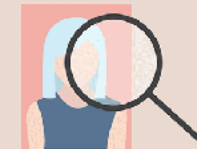
Human Resources (HR) Representative