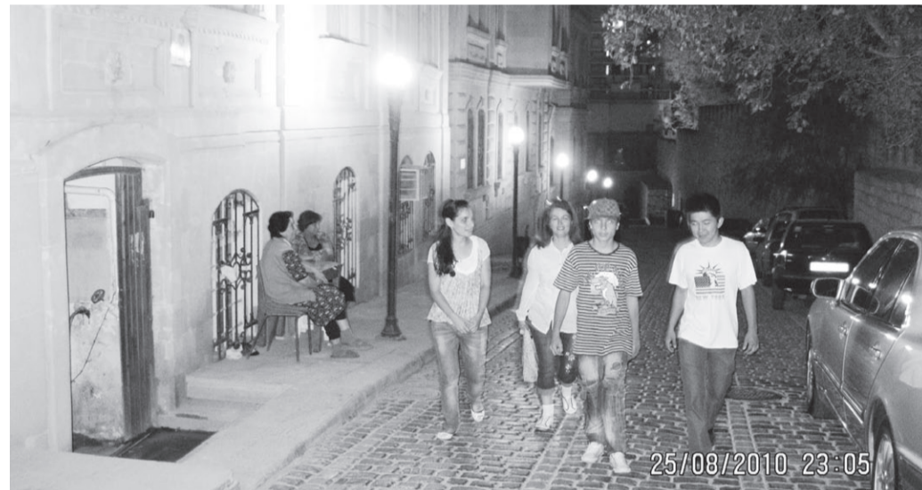
The street where one of the episodes of the movie "Brilliant Hand" was filmed

It is our club's motto. It is simple, and has a straight meaning; a head